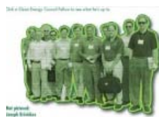
Following the Clean Energy Council Fellows